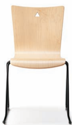
Little Marquette chair crescent shell, triangle cut-out.