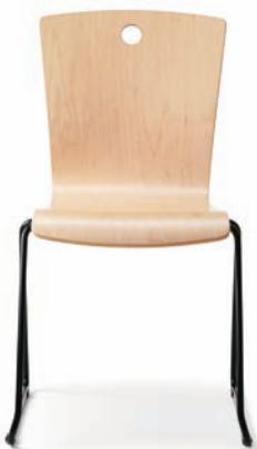
Little Marquette chair arc shell, circle cut-out.

Little Marquette chairs and tables are everything you would expect from such a distinguished family. Design: Seating, Leland Design Group; table, 2B Studio