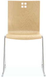
Side Chair w 19¾ d 21 h 34 sh 18½