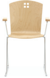
Arm Chair w 22½ d 21 h 34 sh 18½