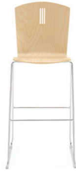
Bar Chair w 19½ d 23 h 44 sh 30¼