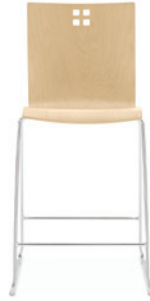
Counter Chair w 19¼ d 22¼ h 39¾ sh 25½