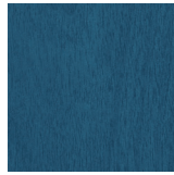
Ink II (18M)