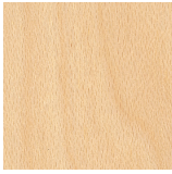
Natural Maple (11M)

FINISHES / Transparent Wood Options; Semi-Gloss Sheen