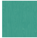
Caribbean II (48M)