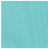
Arctic II (16M)

FINISHES / Semi-Transparent Wood Options; Matte Sheen