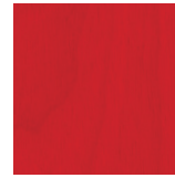
Soda Red (46M)