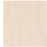
White Wash II (30M)

Please reference each product spec guide for available finishes and materials as not all options are available on all products.