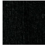
Transparent Black (29M)